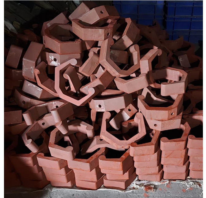
REHEATING FURNACE REFRACTORY MATERIALS