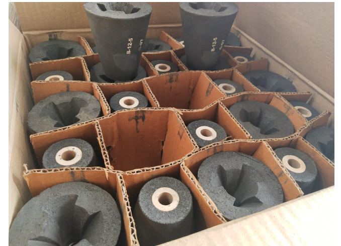
FLOW CONTROL & LADLE REFRACTORIES