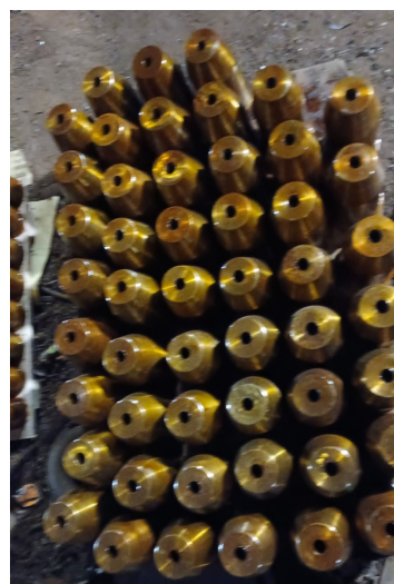
ROLLING MILL SPARES